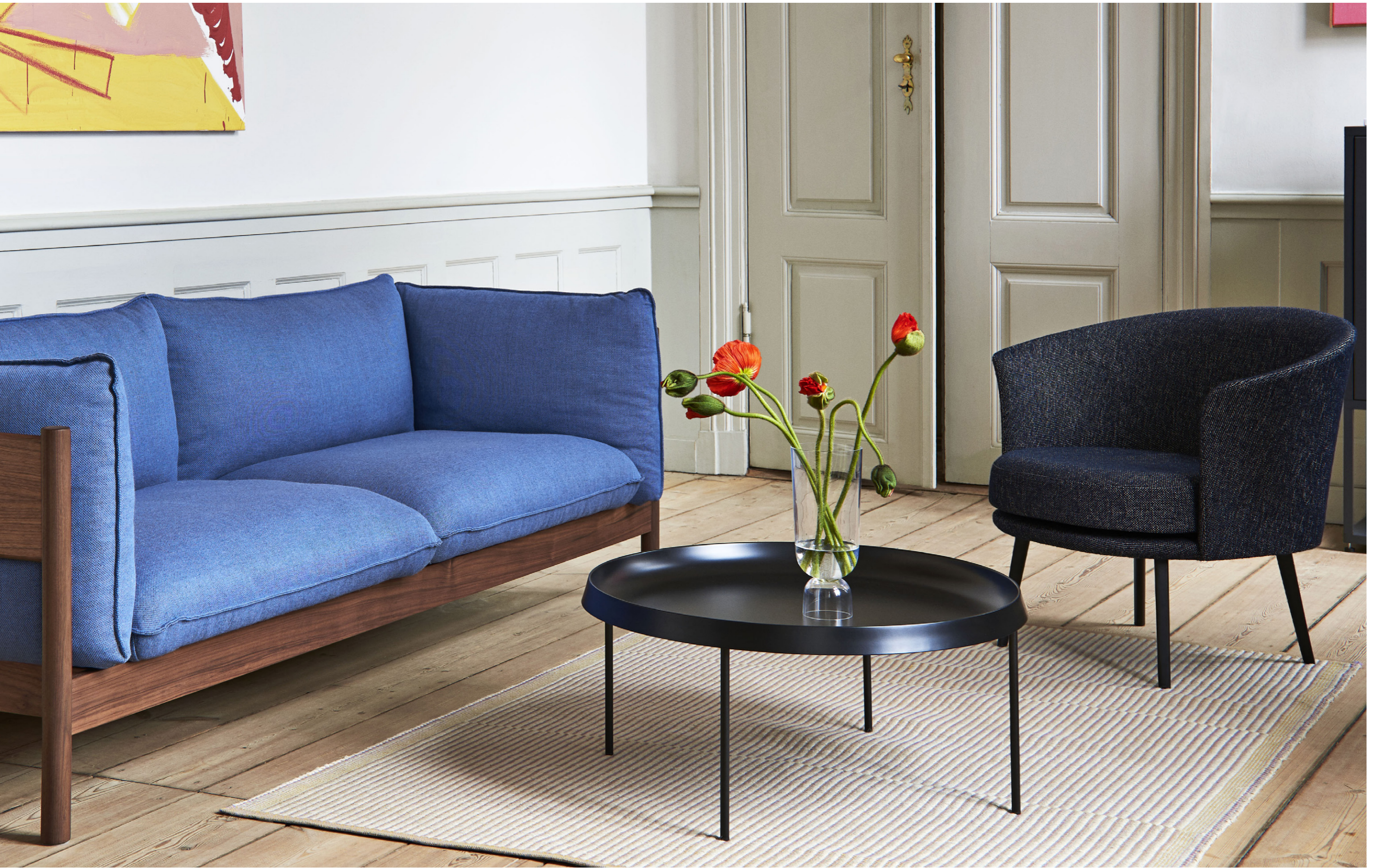
Fairway Dark Blue 308-288