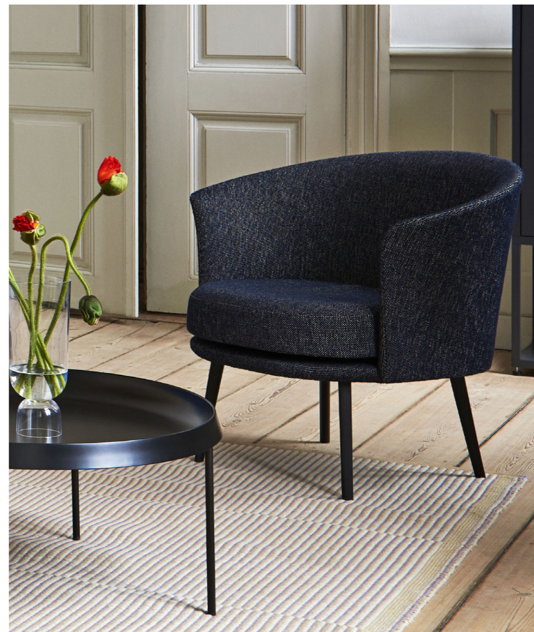
Fairway Dark Blue 308-288