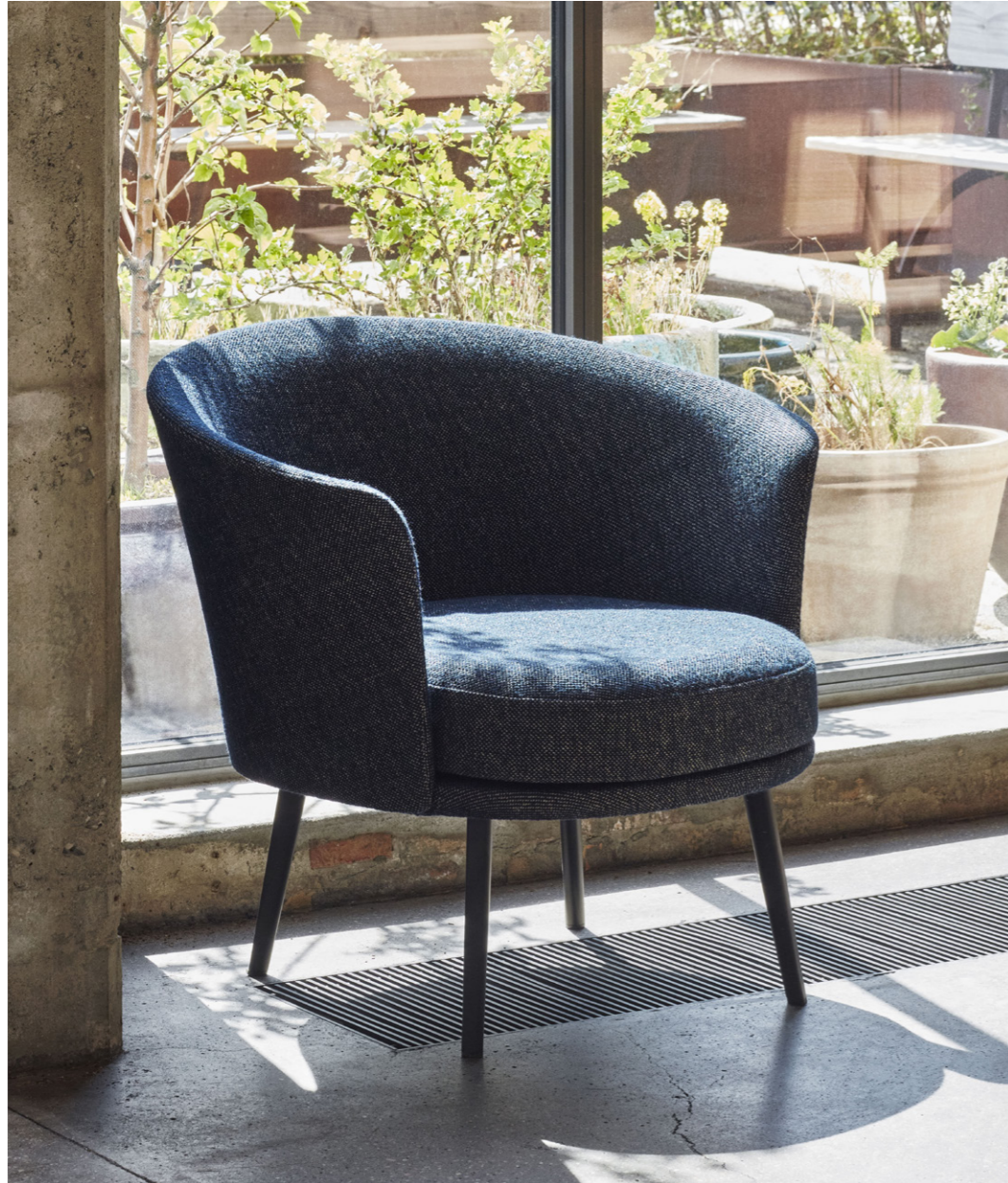
Fairway Dark Blue 308-288