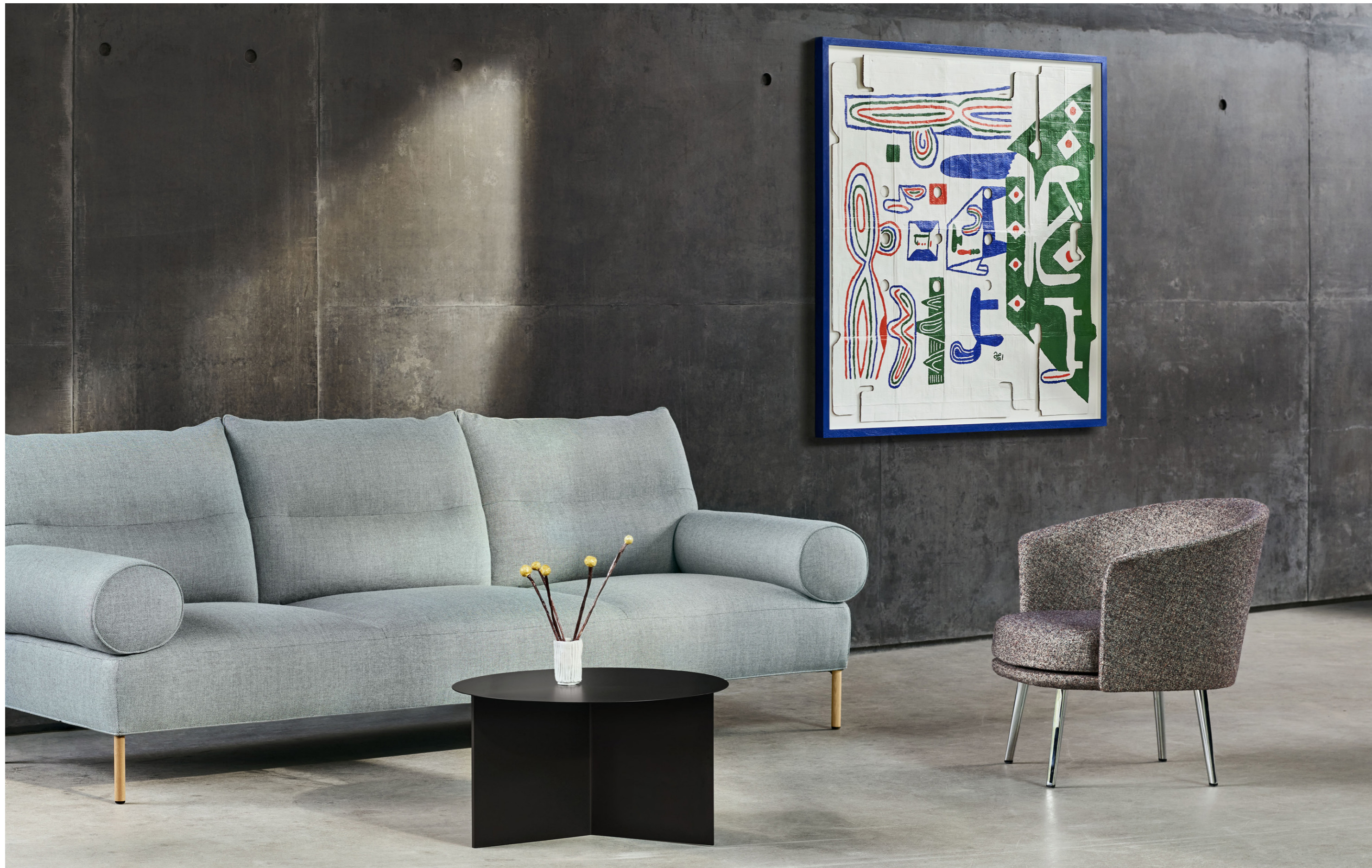
Swarm Multi Colour