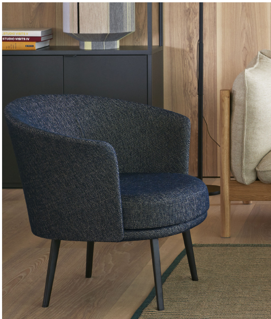
Fairway Dark Blue 308-288