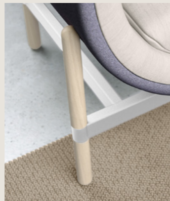
white wash oak legs white powdercoated frame