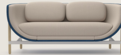
CAPSULE LOUNGE 2-SEATER