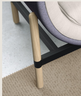
black varnished legs black powdercoated frame