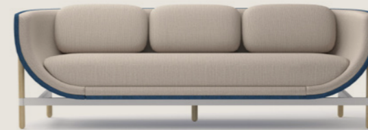
CAPSULE LOUNGE 3-SEATER