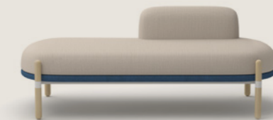
CAPSULE BENCH RIGHT/LEFT BACKREST 4236/08 - 4236/09