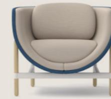
CAPSULE LOUNGE 1-SEATER