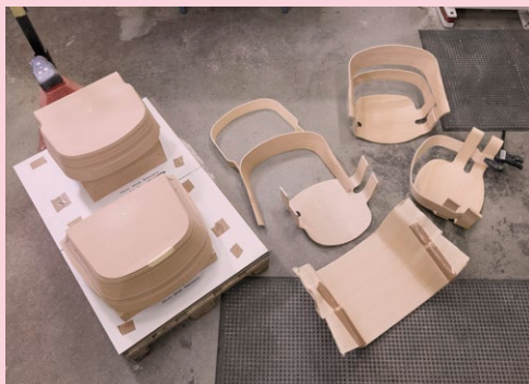
Wick Chair is manufactured in Nybro, in the Swedish furniture industry's heartland.