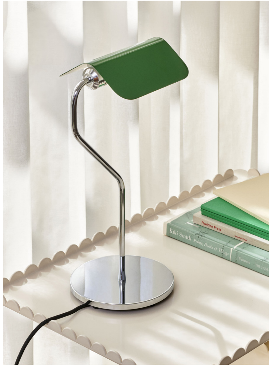
Apex Table Lamp | Emerald green