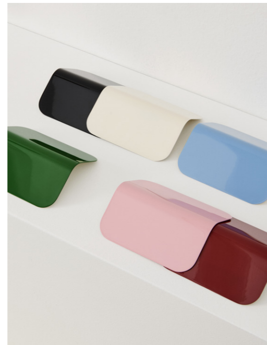
Folded steel shades