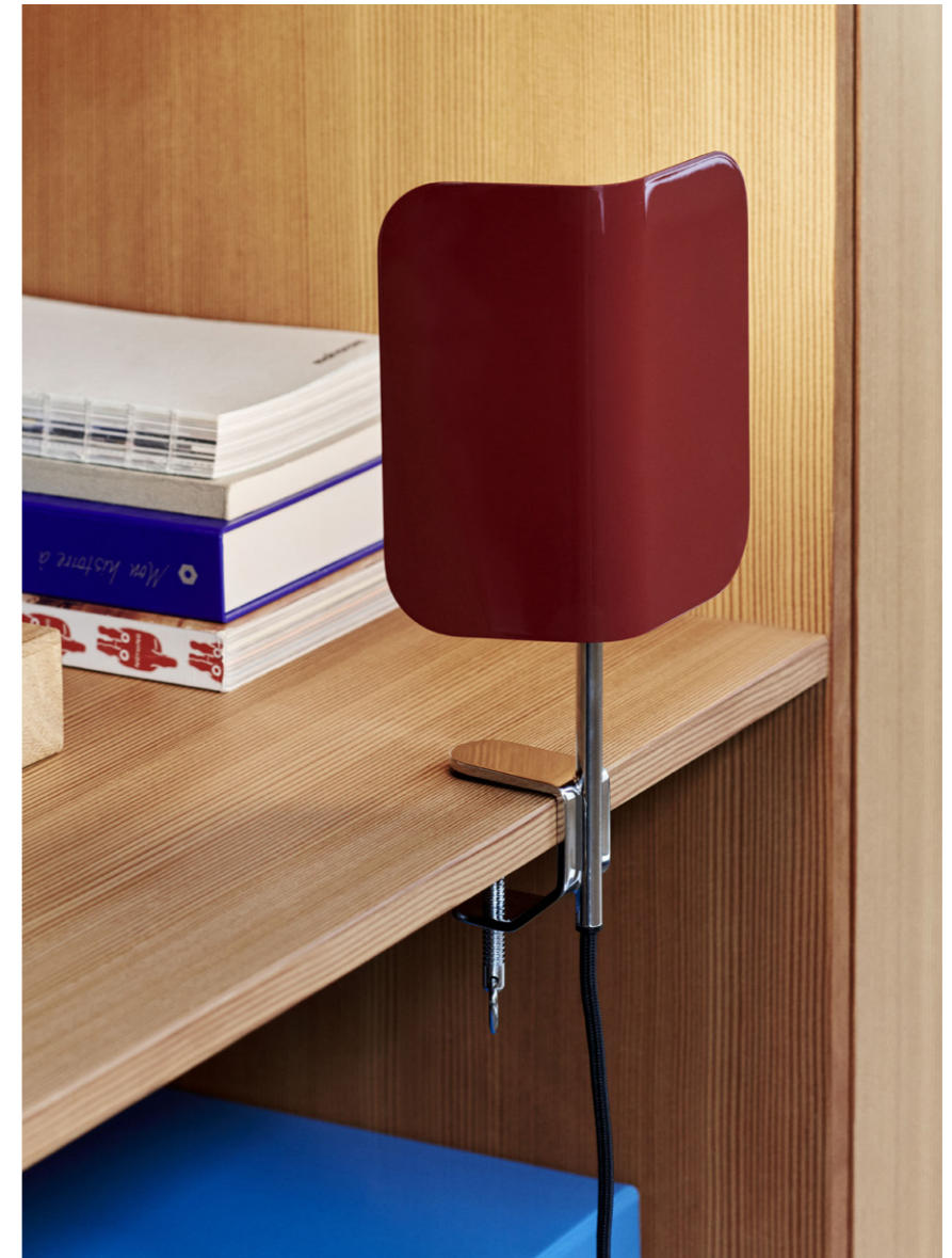
Apex Clip Lamp | Maroon red