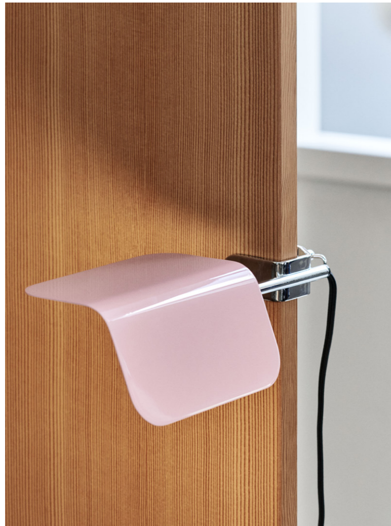
Apex Clip Lamp | Luis pink

Focusing on colour as a core element of the design, Apex's distinctive folded steel shade uses vibrant tones to create a graphic contrast to the chrome-plated bases. Available in several different models – the Clip Lamp, Desk Clip Lamp, Desk Lamp, and Table Lamp – there is an Apex member that caters to every space and situation, from a task light in a workspace to an ambient lamp in the bedroom.