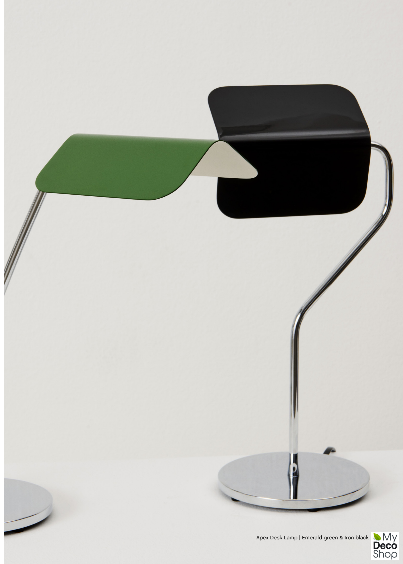
Apex Desk Lamp | Emerald green & Iron black