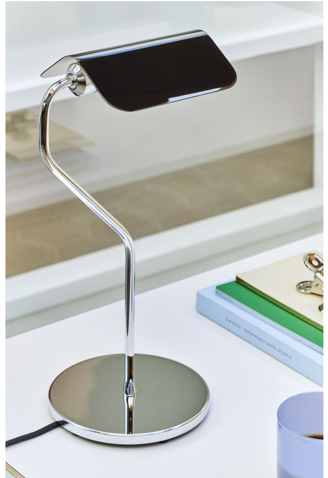
Apex Table Lamp | Iron black