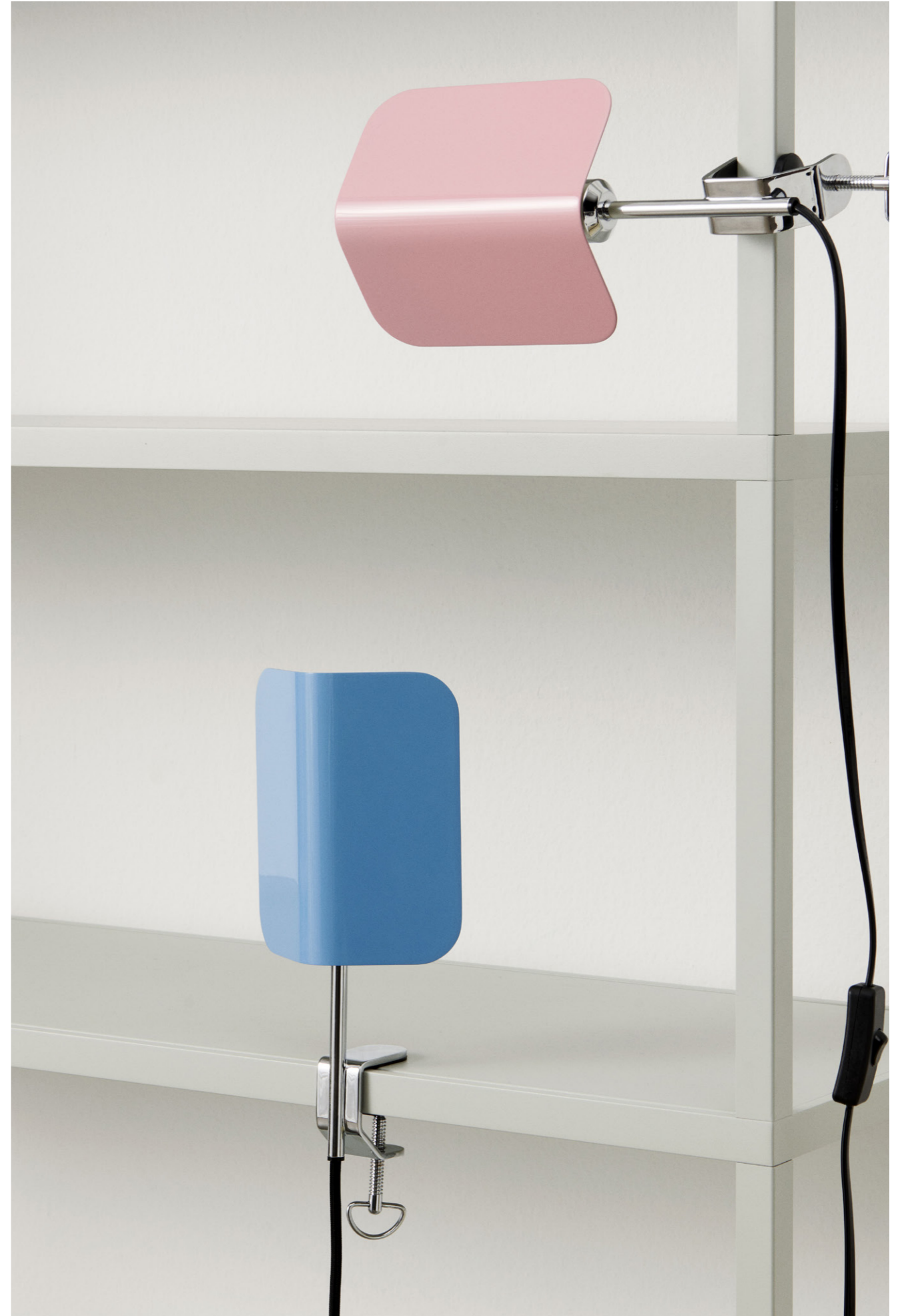
Apex Clip Lamp | Pastel blue & Luis pink