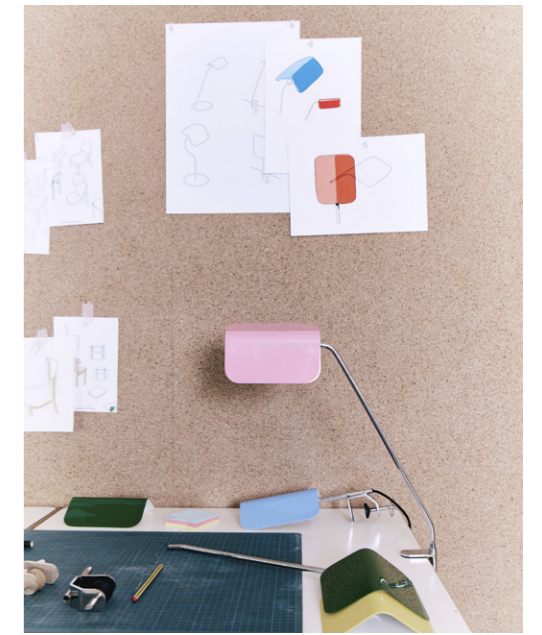
Colour is used as a key element in the folded steel shades, creating strong and colourful graphic shapes.