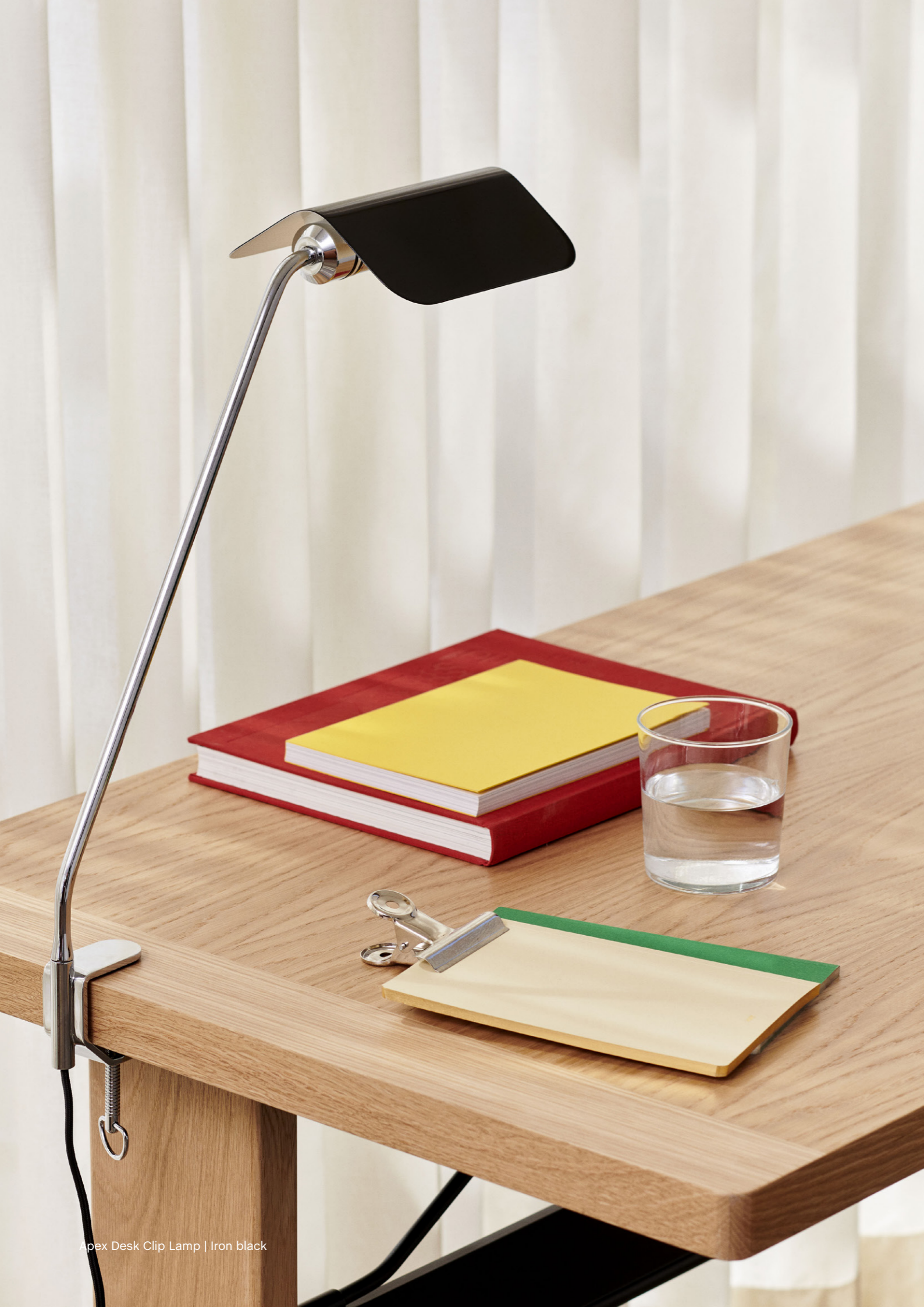
Apex Desk Clip Lamp | Iron black