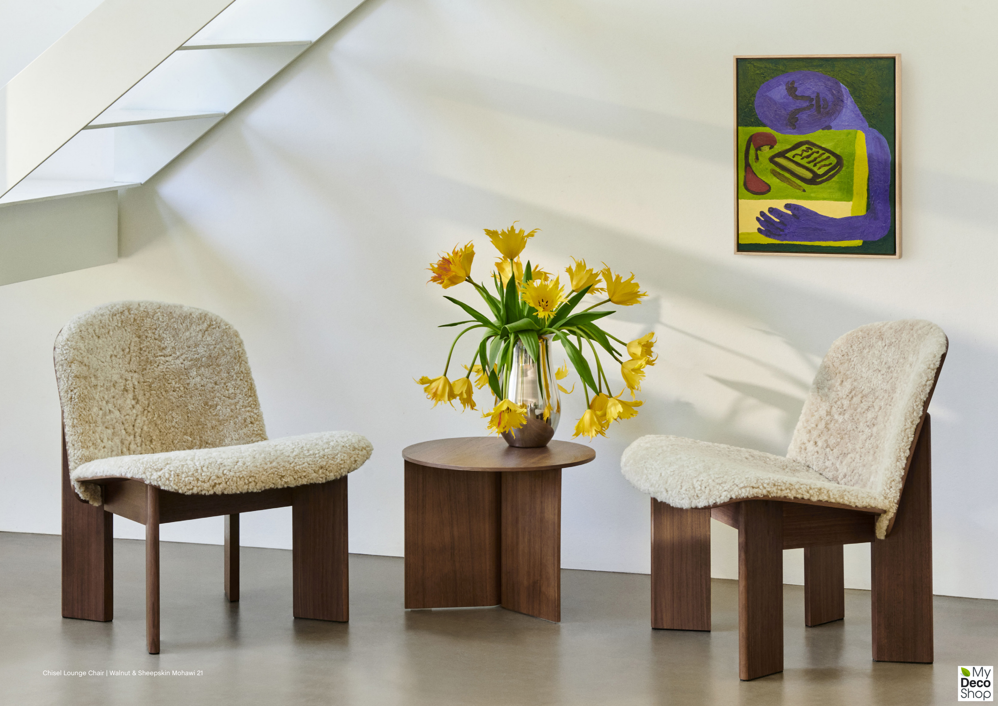
Chisel Lounge Chair | Walnut & Sheepskin Mohawi 21