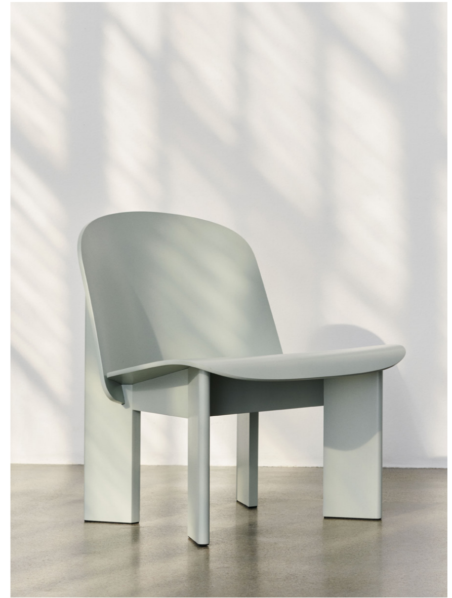
Chisel Lounge Chair | Eucalyptus