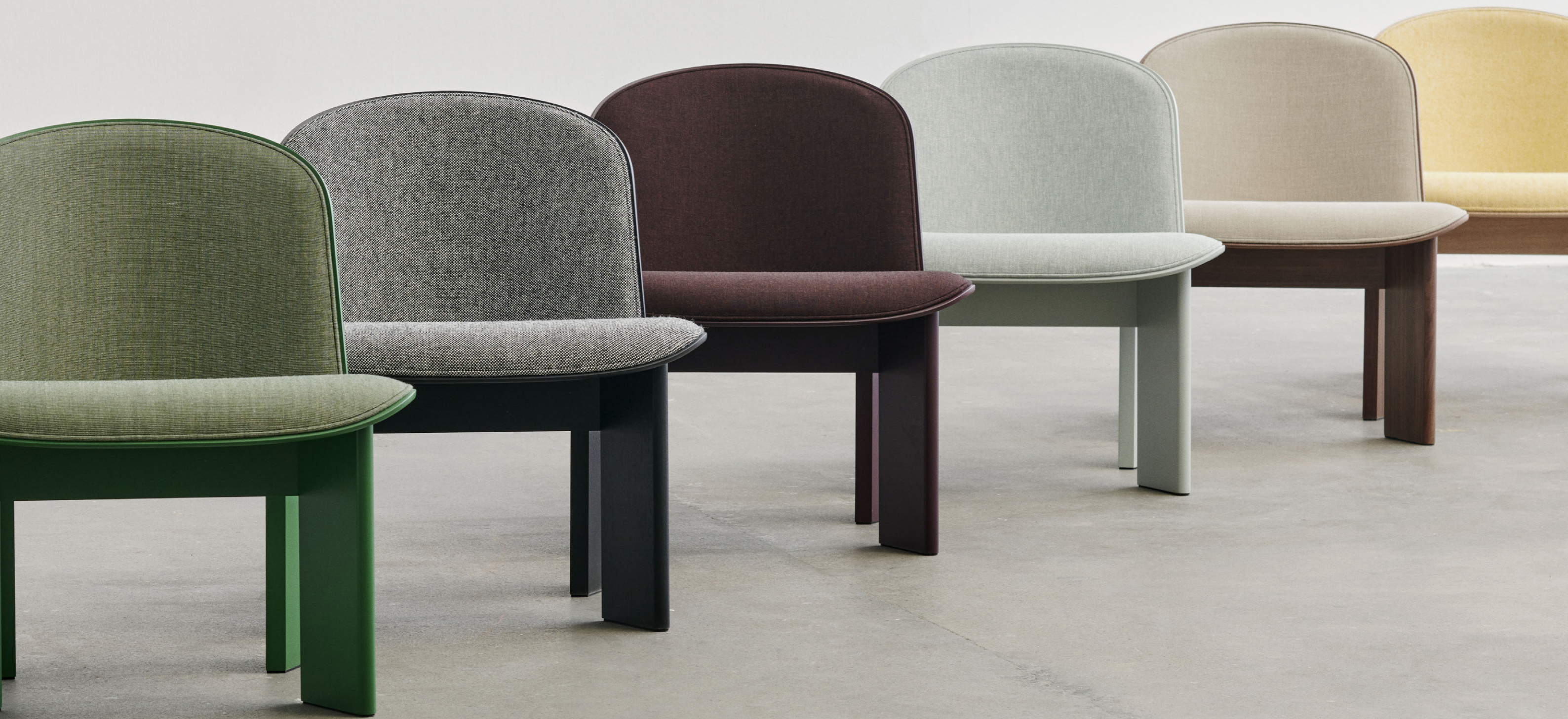
Chisel Lounge Chair Family