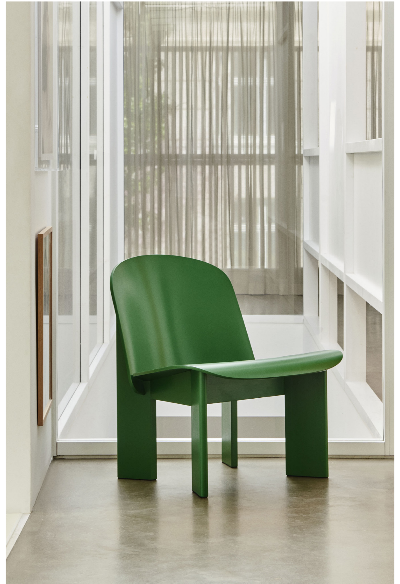
Chisel Lounge Chair | Lush green