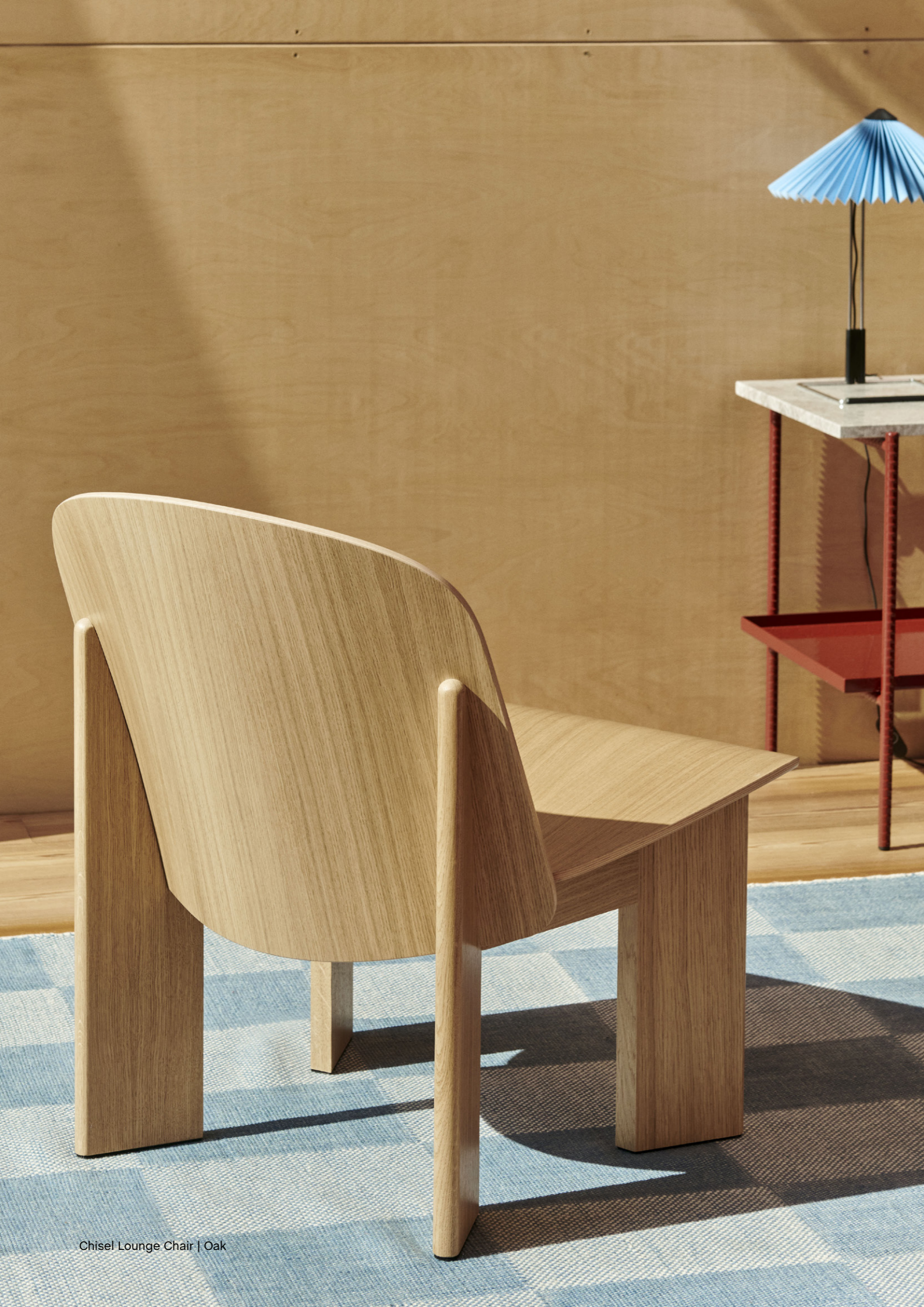
Chisel Lounge Chair | Oak