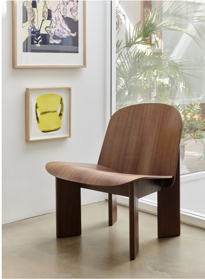
Chisel Lounge Chair | Walnut