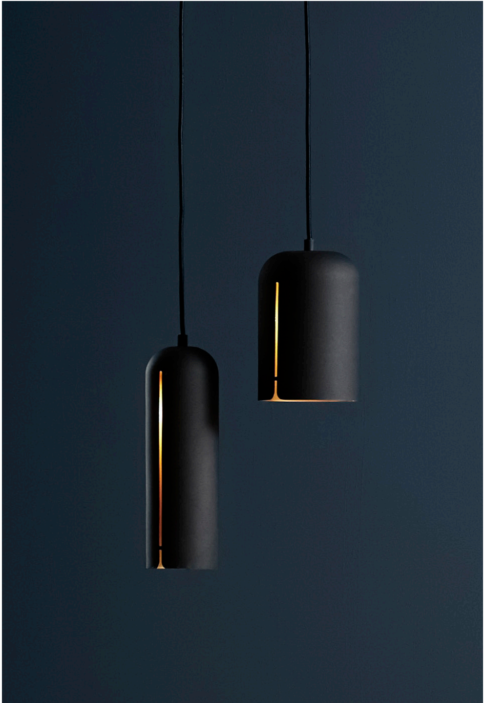
GAP PENDANTS designed by Nur