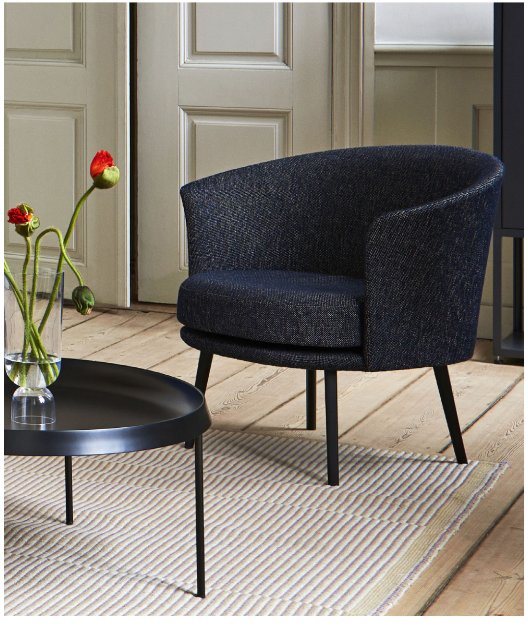
Fairway Dark Blue 308-288