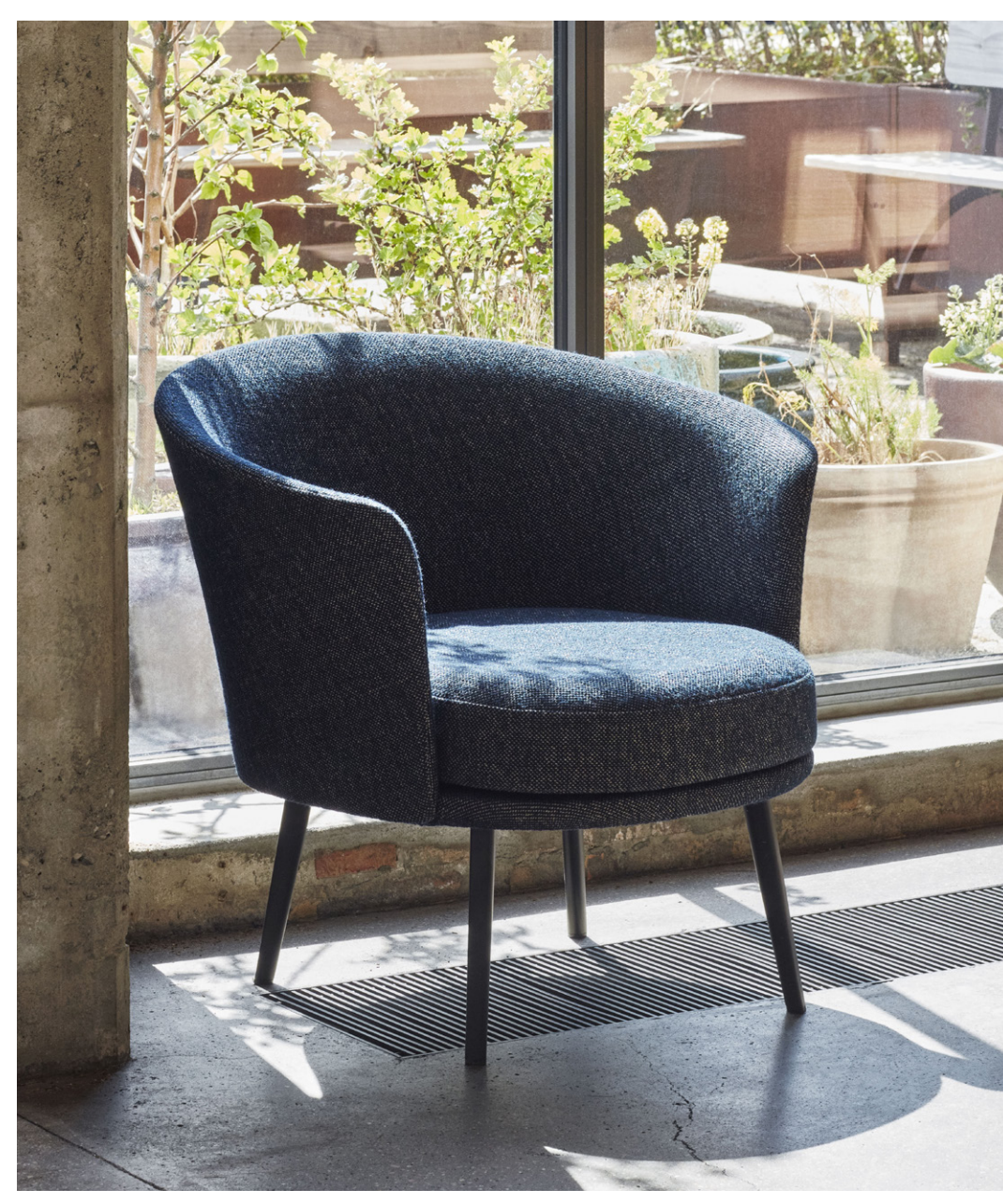
Fairway Dark Blue 308-288