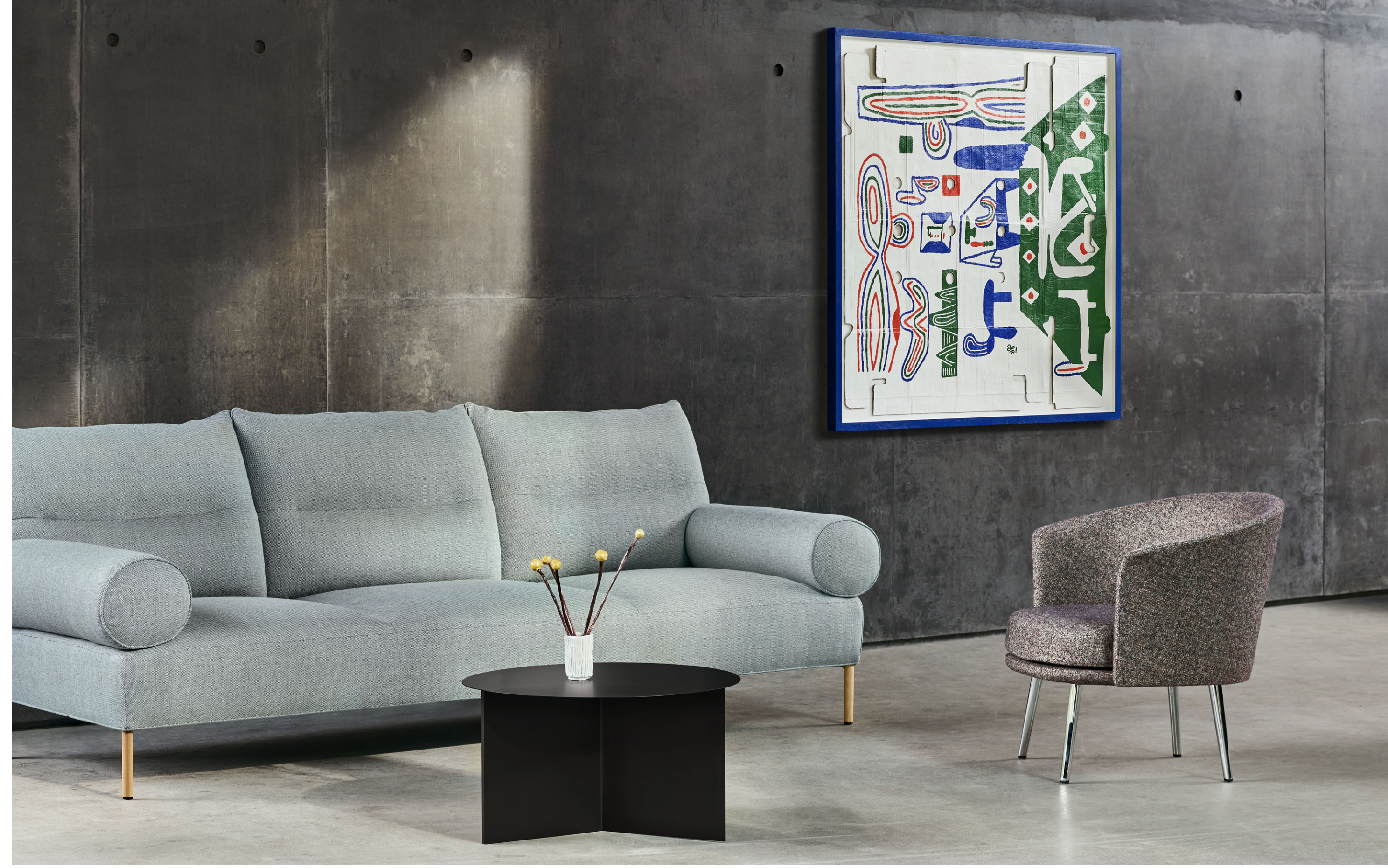
Swarm Multi Colour