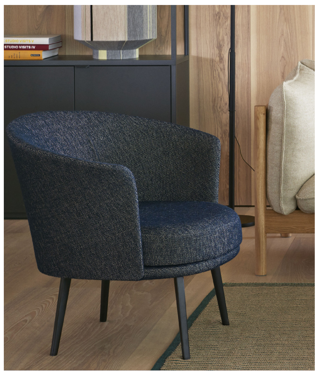
Fairway Dark Blue 308-288