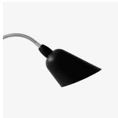
Black & steel