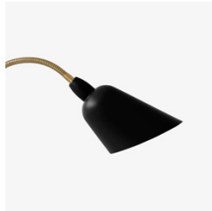
Black & brass