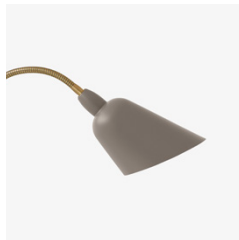
Grey beige & brass