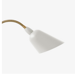
Ivory white & brass