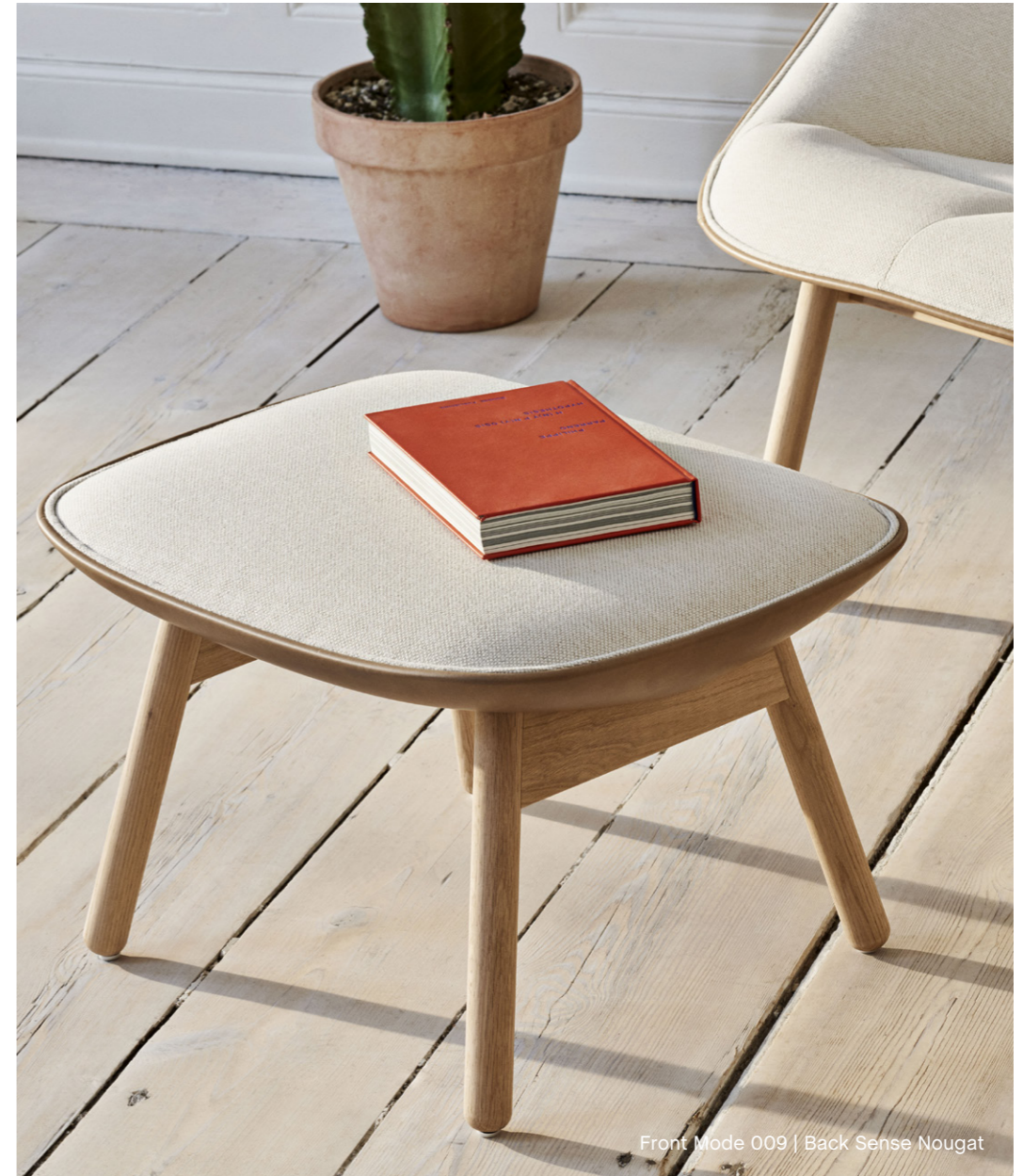
Front Mode 009 | Back Sense Nougat