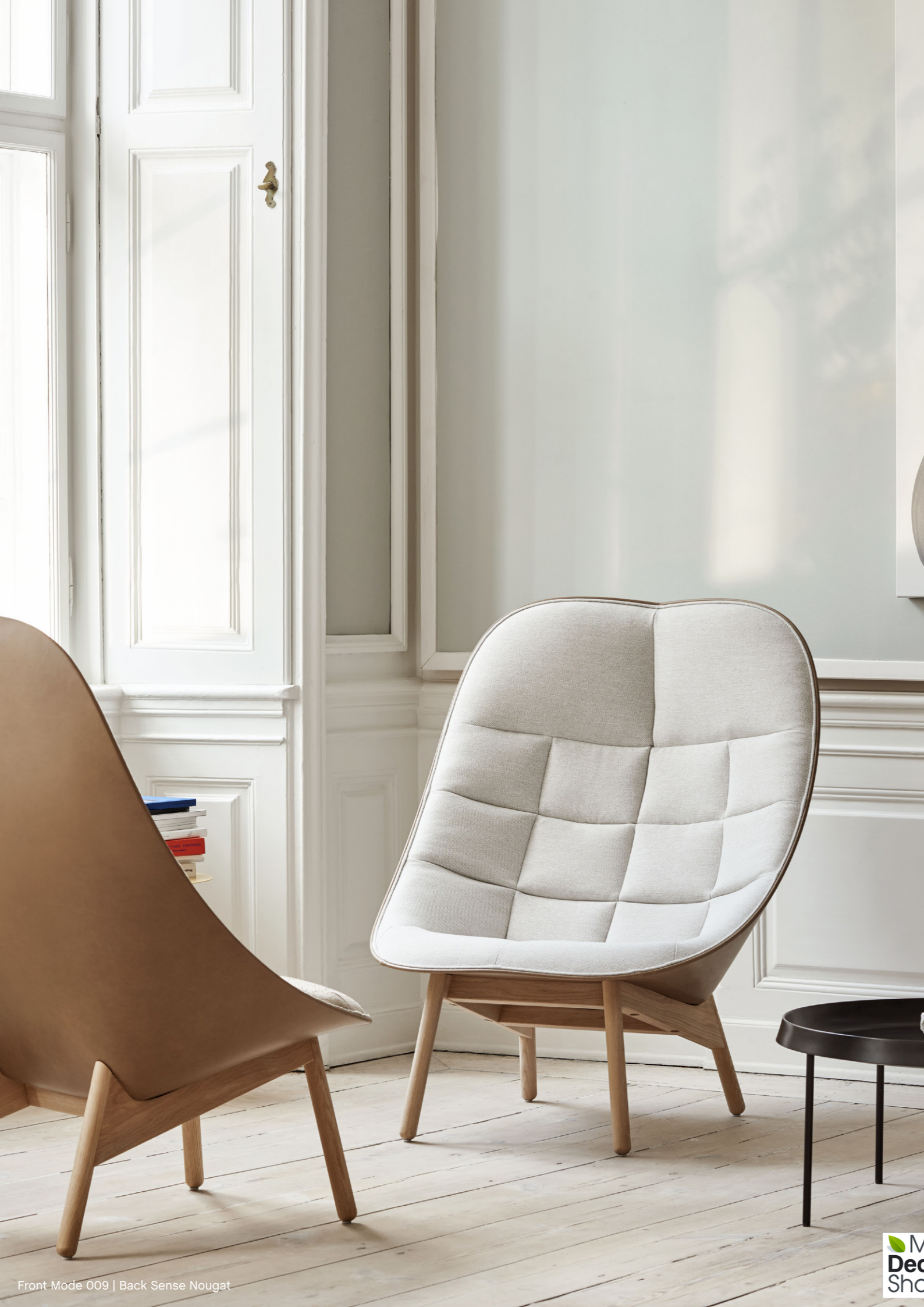
Front Mode 009 | Back Sense Nougat