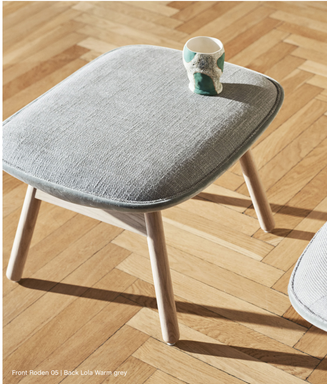
Front Roden 05 | Back Lola Warm grey