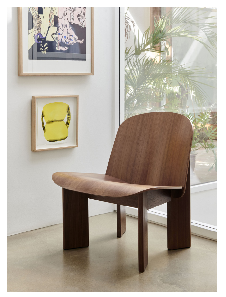
Chisel Lounge Chair | Walnut