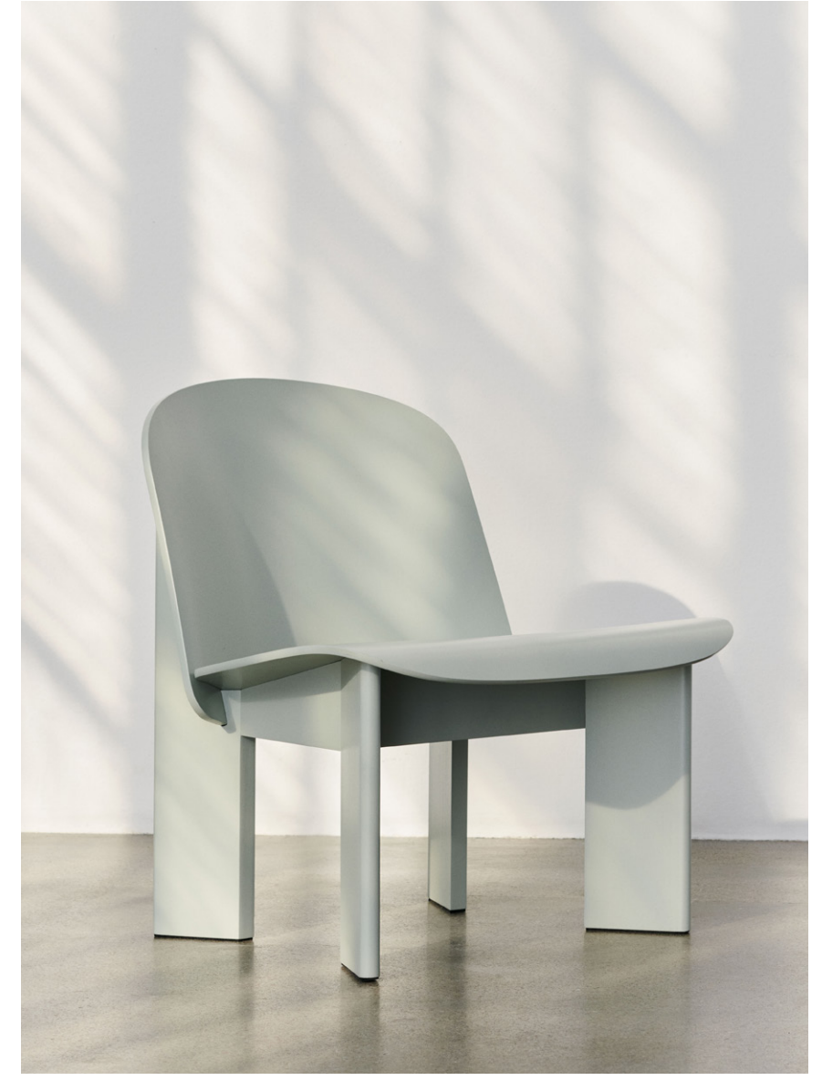
Chisel Lounge Chair | Eucalyptus